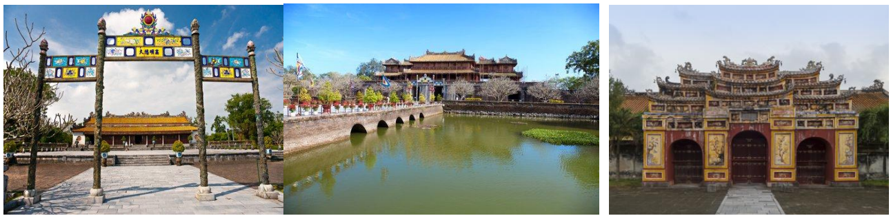
Entrance of Citadel, Huế City

Our post-Conference Tour is now finalized. We leave on July 12 morning from Ho Chi Minh City airport to reach Huế city by flight (1.5 hour). After spending most of the day hours, we drive by limousine bus to the city of Danang and stay overnight. On July 13, we go to Mỹ Son, the historic city. On July 13, we come back to Danang for night stay. On July 14, we visit the highlights of Danang and Hoi An city(connected with the old Champa civilization). In the night after dinner, we fly from Danang to HCM( 1 hour) for overnight stay in the same Hotel of the city.