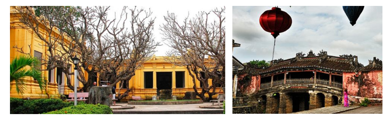
Hoi An Cham Museum