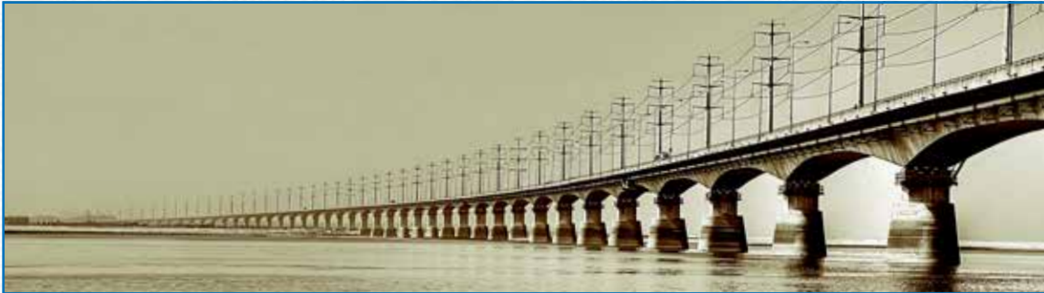
Bangabandhu Bridge on the Jamuna River