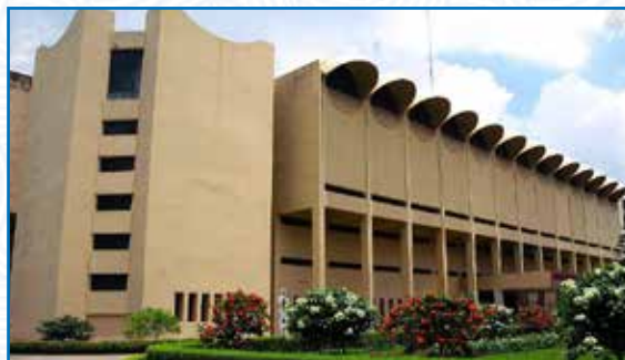
Bangladesh National Museum