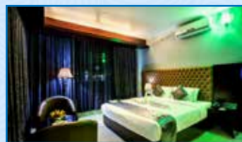
Dinner and night stay at Momo Inn, Bagura