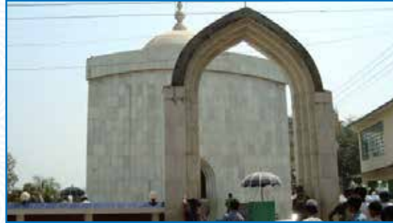
Shah Sultan Balkhi Mahisawar Mazar