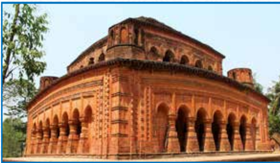
Navaratna Hatikumrul Temple